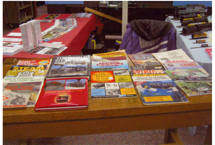
The book table – always a plus in a library.