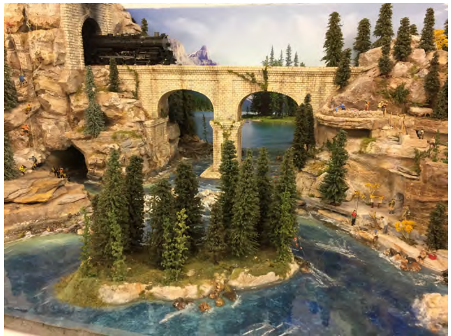
Pam MacPhail's Best of Show winner