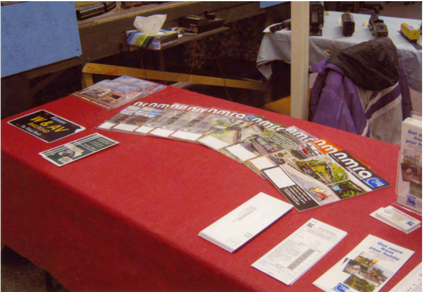
The NMRA table including the NMRA Magazine and membership information.