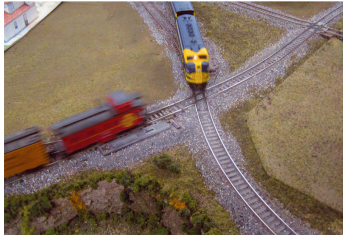
A crowd-pleasing feature of Phil's layout is this crossover. Just enough cars are added to the train to create a near miss between the locomotives and the caboose.