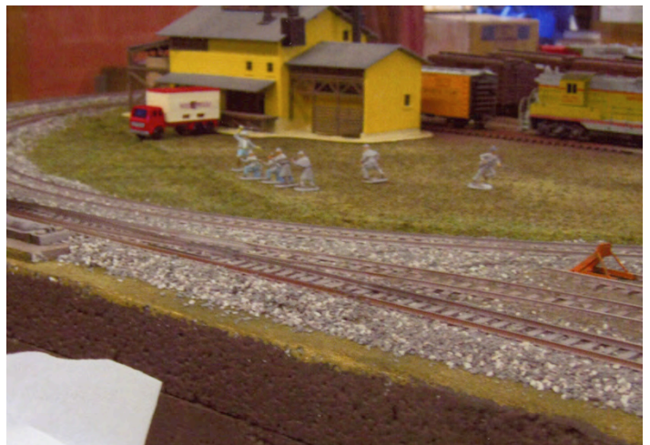
Civil War scene.