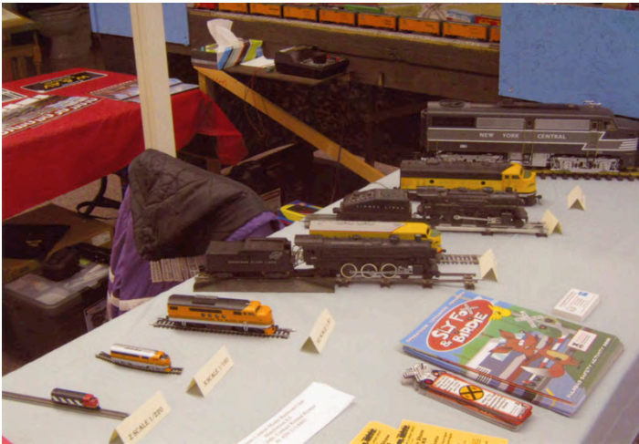
A display of engines representing scales from Z to G.