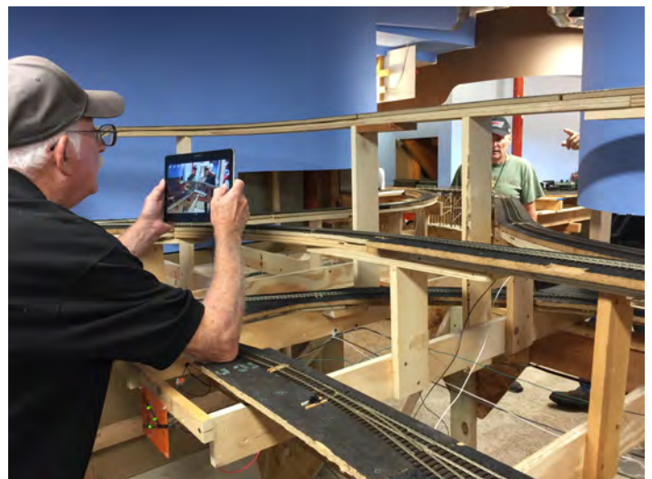
It will be interesting to see what the final scenery will look like in this area. The sky backdrop curves around on both sides with an opening in the middle.