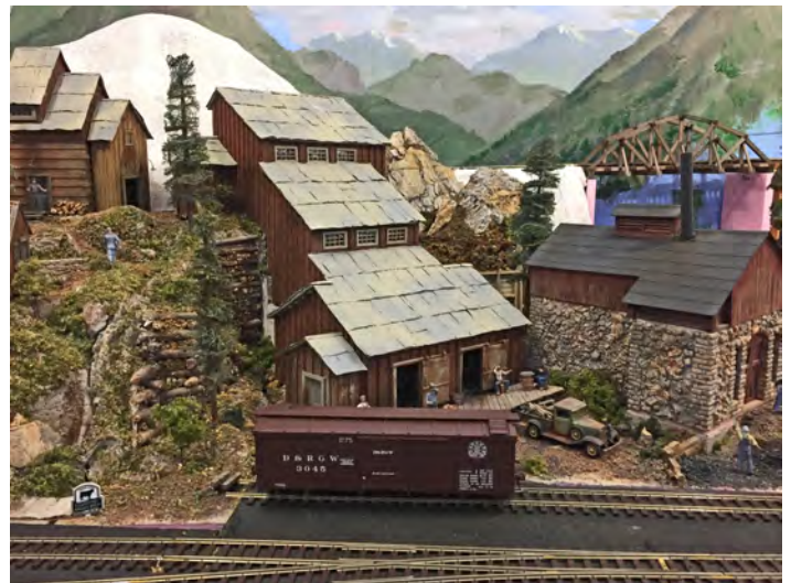
This mine and mill scene is quite eye-catching as is the painted backdrop.