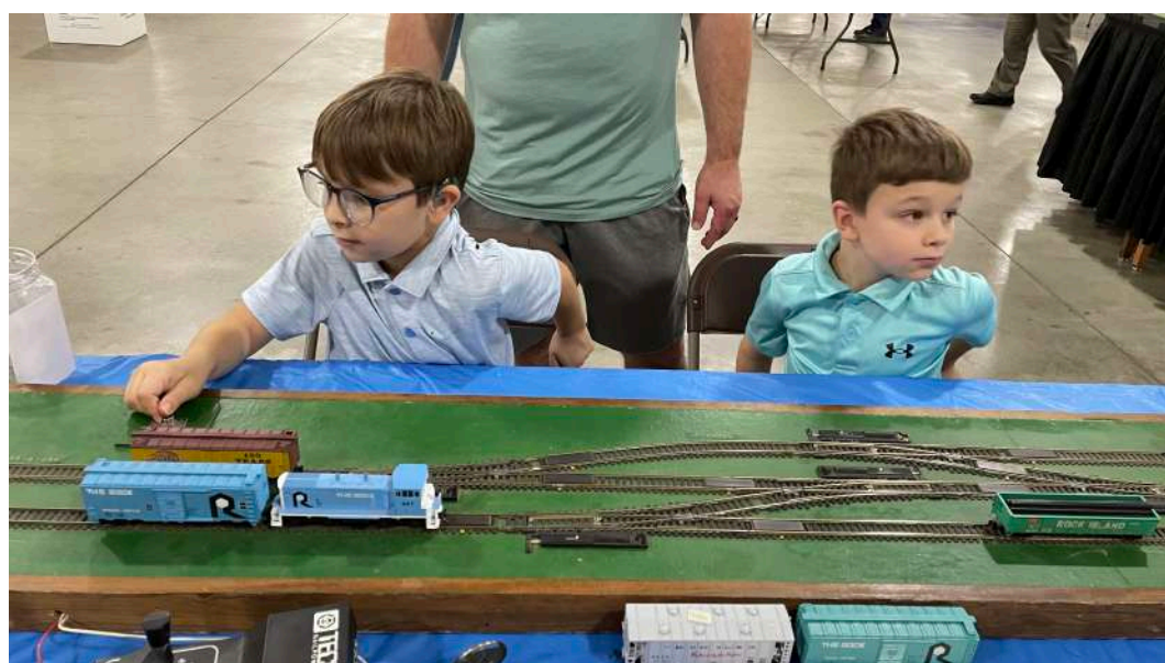
Kids seem to really like the Time Saver. The puzzle can be made less complicated for younger folks and more complicated for grownups. In this case, dad is watching from behind and making sure each of his sons got a hand at the throttle.