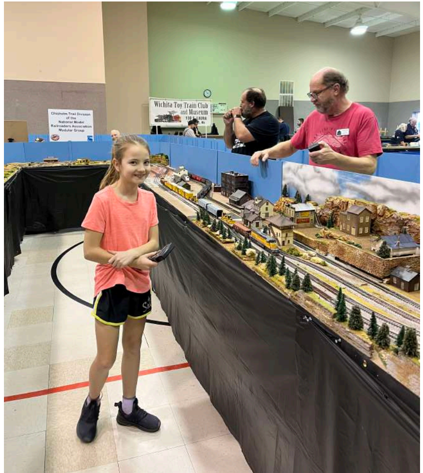
Seeing the next generation take the throttle gives us all hope that the hobby is alive and well.