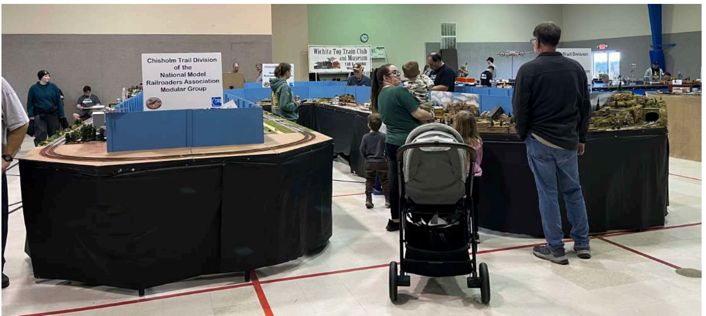
When the whole modular layout is set up, it's no longer a matter of whether we can get enough modules to fill the space; rather it is whether we can get enough space for the modules.