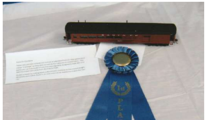
First Place Passenger Car