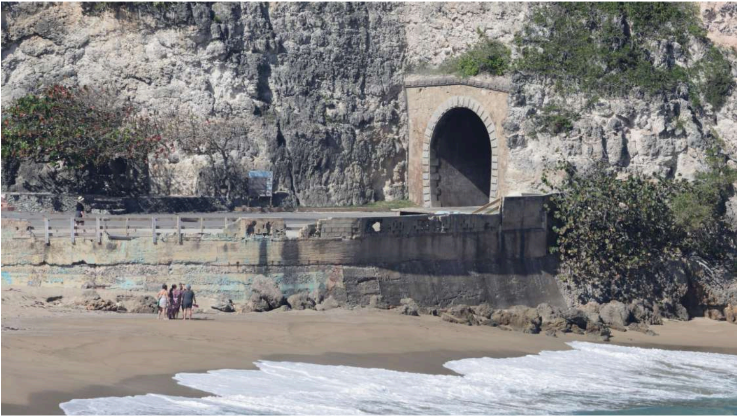
The Guajataca Tunnel in Puerto Rico. Trains haven't been through it since 1957, but it is now an official Puerto Rican Historical Monument. We didn't get to explore it since we were after birds, but this telephoto shot brings it closer than we actually were. It would have been a nice train ride along the shore.