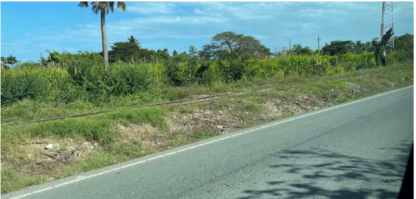
A grab shot out the van window shows a narrow gauge sugar cane railroad in the Dominican Republic. I couldn't tell you what gauge it was if my life depended on it except that it wasn't 4'8.5" for sure. If I had to guess, I'd call it 3'6" as that is a common one in the Dominican Republic.