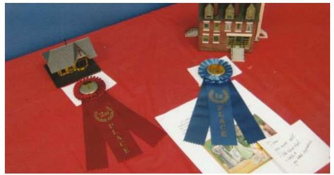
Second and First Place Structures