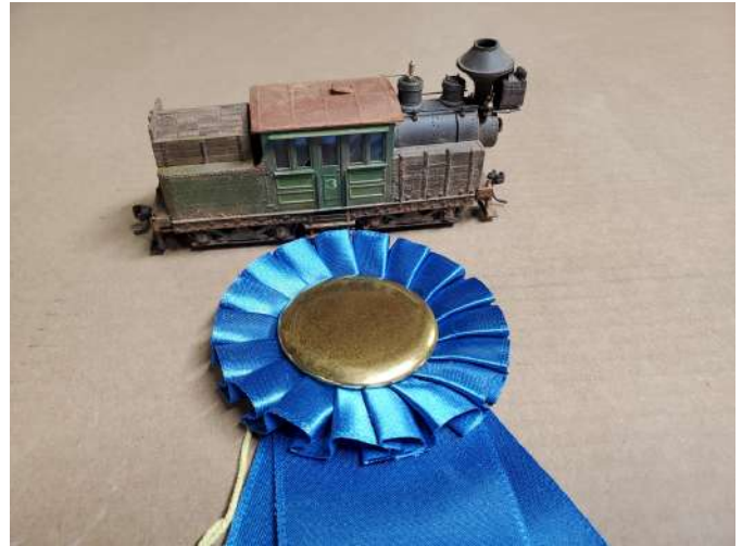
First Place Steam Locomotive