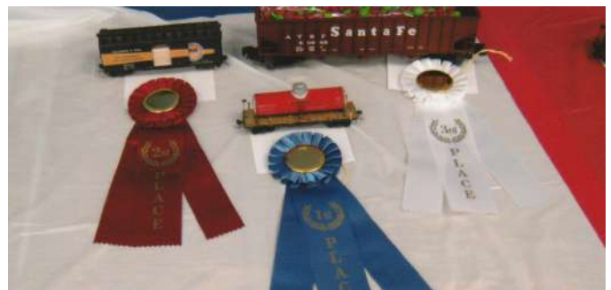
Second, First, and Third Place Freight Car