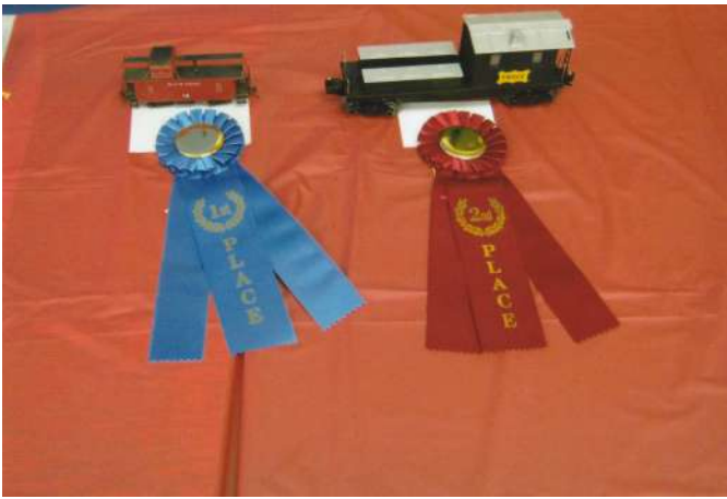
First and Second Place Caboose