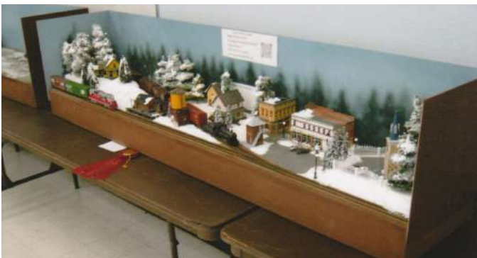
Second Place Diorama