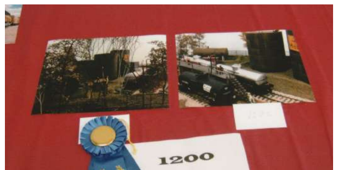
First and Second Photos Model