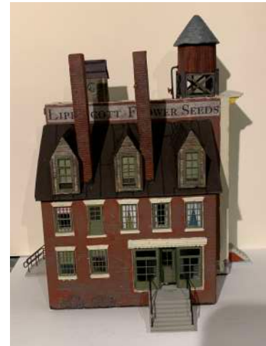
First Place Structures