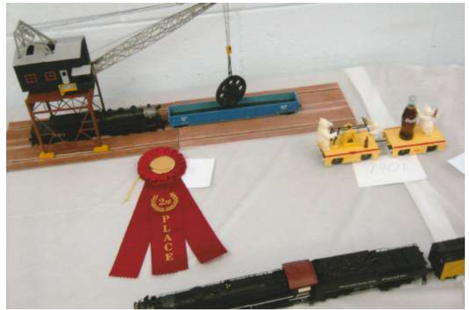
Third Place Favorite Train