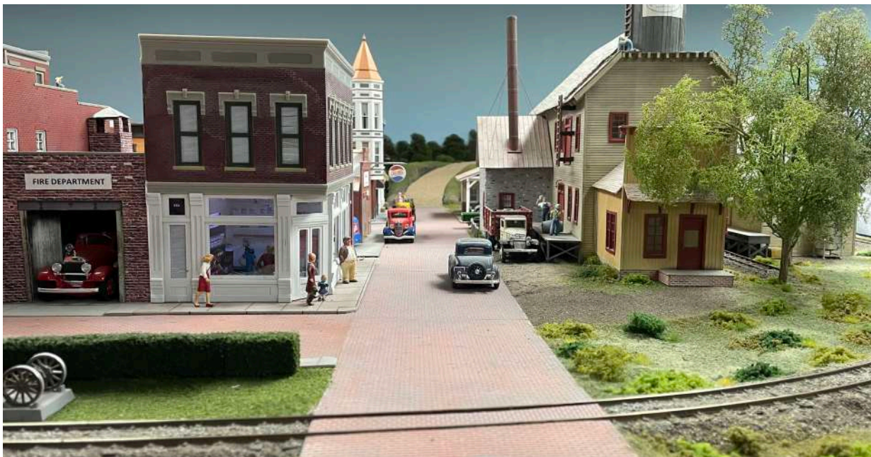
Down town scene.