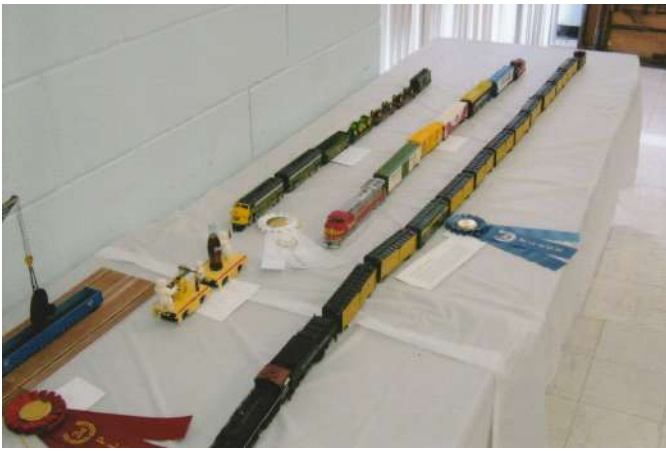
Second and First Place Favorite Train