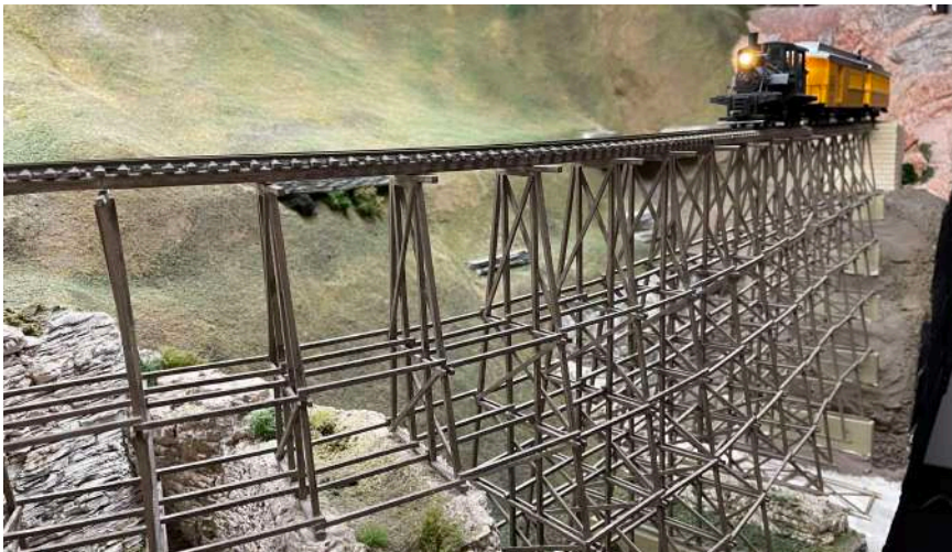
Left: A passenger train crossing the high spindly trestle. There must not be much of a hurry on the narrow gauge since the varnish is being towed by a Heisler logging locomotive.