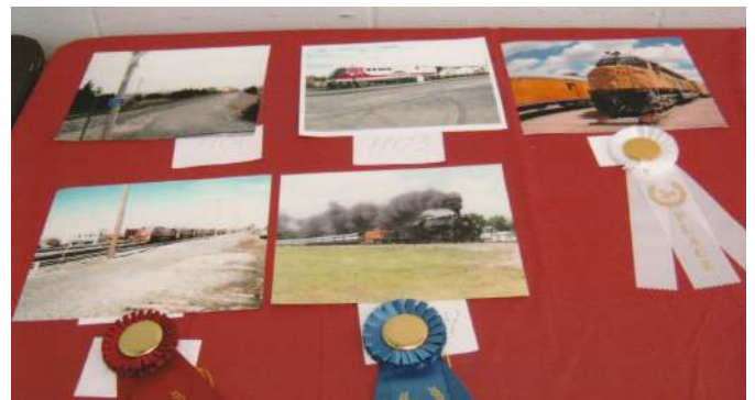
Second, First, and Third Place Photos Prototype