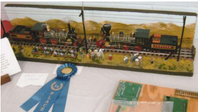
First Place Diorama & Best of Show