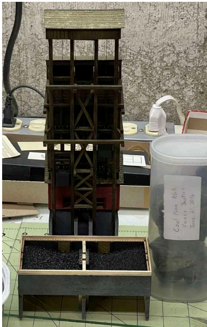
My coaling tower project now has all the roofs on it, the buckets and pulleys all rigged, and part of the coal pit attached below the hoist house. The rest of the pit is under construction in the foreground. The pit does have coal in it now. The coal was collected from Vance Junction on the Rio Grande Southern.

I wasn't sure if this structure from the Dominican Republic was a dwelling or a shed, but I'm going to call it a shed, despite the satellite dish. Lots of weathering here.