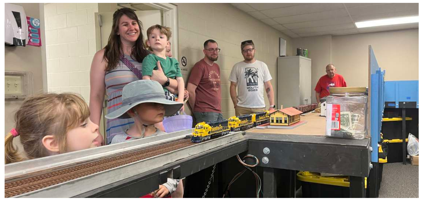
Bel Aire was a real family affair with plenty of kids and their parents.

Arkansas City was also a very good show for us, but a little more hectic. We set up the entire layout 20' x 36' with the "U" on Friday, ran trains Saturday during show hours, and then packed up the entire layout and returned home that evening. Needless to say, we all slept well Saturday night. The show had a nice sampling of vendors and four operating layouts. Some of our guys found some real bargains while shopping with the vendors. When they came back to show us their treasures, it was hard to find our guys when it was their turn to run. (These are the same guys that sat at dinner on Friday night and said, "I'm probably not buying anything. I already have more stuff than I'll ever use.")