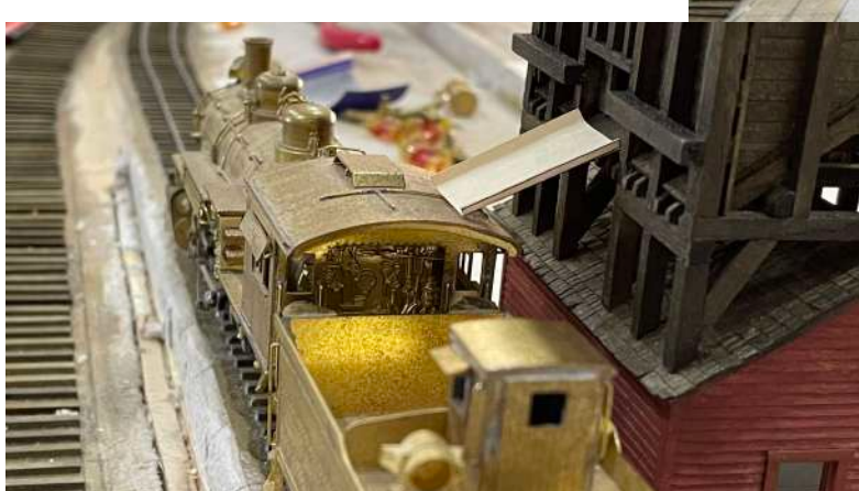
Trial fit of the coaling tower was next. When I was satisfied that I had enough room in front of it for my largest locomotive (a K-37 that has high hopes of hitting the paint shop one of these days), I had to see if the coal chute would clear in the lowered position as shown in the kit instructions or if I would have to build it raised, for which I was on my own without instructions.