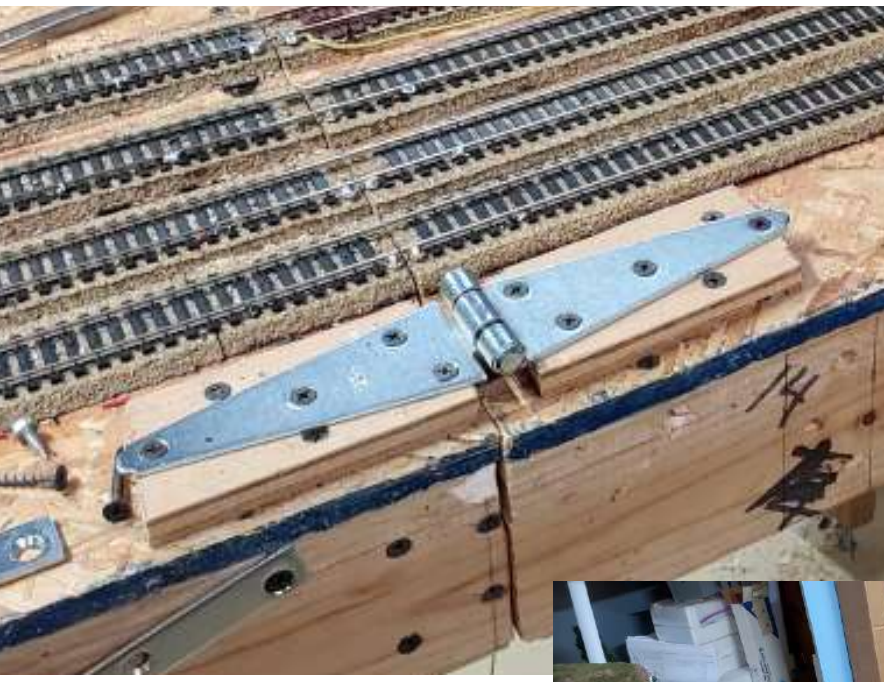
Right away I discovered that the hinges had to be above track level or I couldn't get it up without damage.

The unhinged end had to have enough space below track level to allow the gate to raise in an arc. That end also has alignment blocks and short shelves to keep the lift-up in place when it is down.