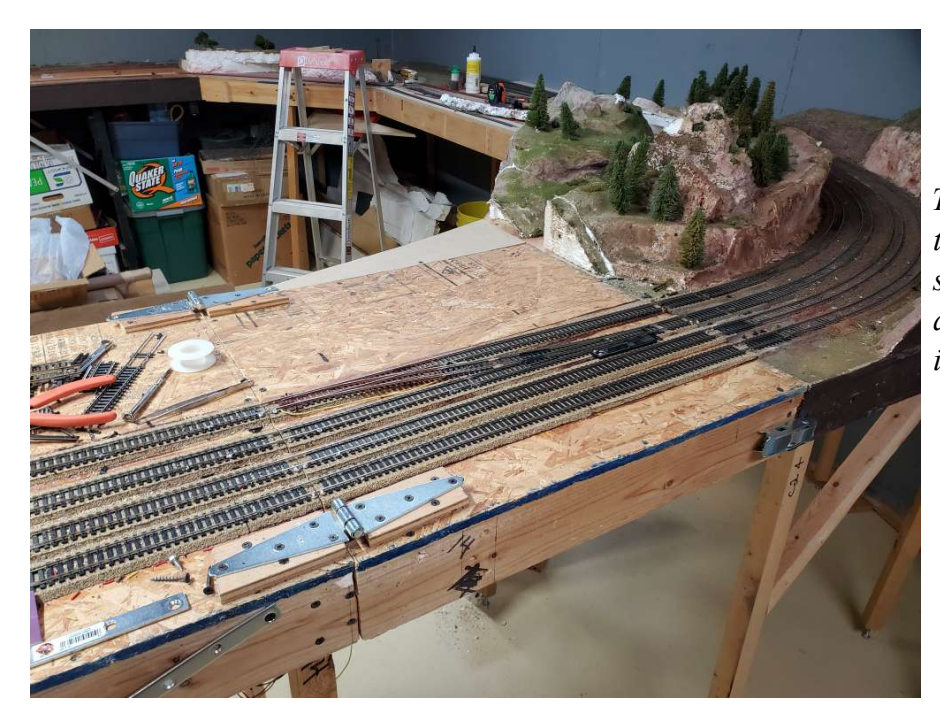
The lift up is in a section with four sets of tracks – main lines with an industrial siding. The crossover just fit the space available and provides access to the industrial track.