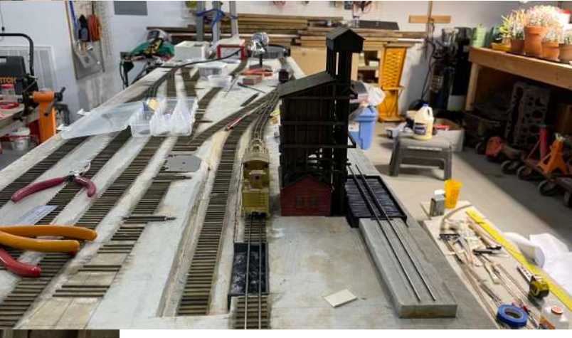
Whoops! The lowered chute won't clear. I will have to modify the kit so that the chute is in its upper position. It took a lot of searching to see just how that worked, but I finally found a decent picture in my own files. And no, I don't plan to build it so it raises and lowers.

So now the middle section has rails spiked down and is ready for wiring except for the ramp to the coaling tower. I'm saving that until after I get the module into the basement. If you think I want to take the chance of bashing the installed tower during the move, you would be sadly mistaken! My aisles are wide enough to work on that before I slide the modules into their final location.