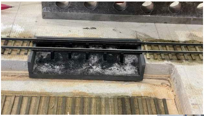
The center module took some serious fitting and I still can't guarantee that I have it right. I had to do some cutting and fussing to get a ramp down for the ash pit and a ramp up for the coaling tower. The ash pit was scratch built and it came first since it is on the turntable lead and the coaling tower's final position is tied to that.