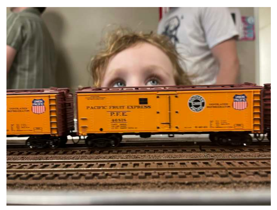
I'd bet all of us old buggers had the same sense of wonder about the trains in our youth. The picture is from Bel Aire.

We saw some familiar faces from our NMRA show back in February. The best part of doing these shows is seeing friends, families with kids, and talking to modelers of all skill levels. We had a lot of spectators and many questions about the hobby, and 1 or 2 inquiries about the NMRA meetings. Hope to see those folks at one of our upcoming meetings.