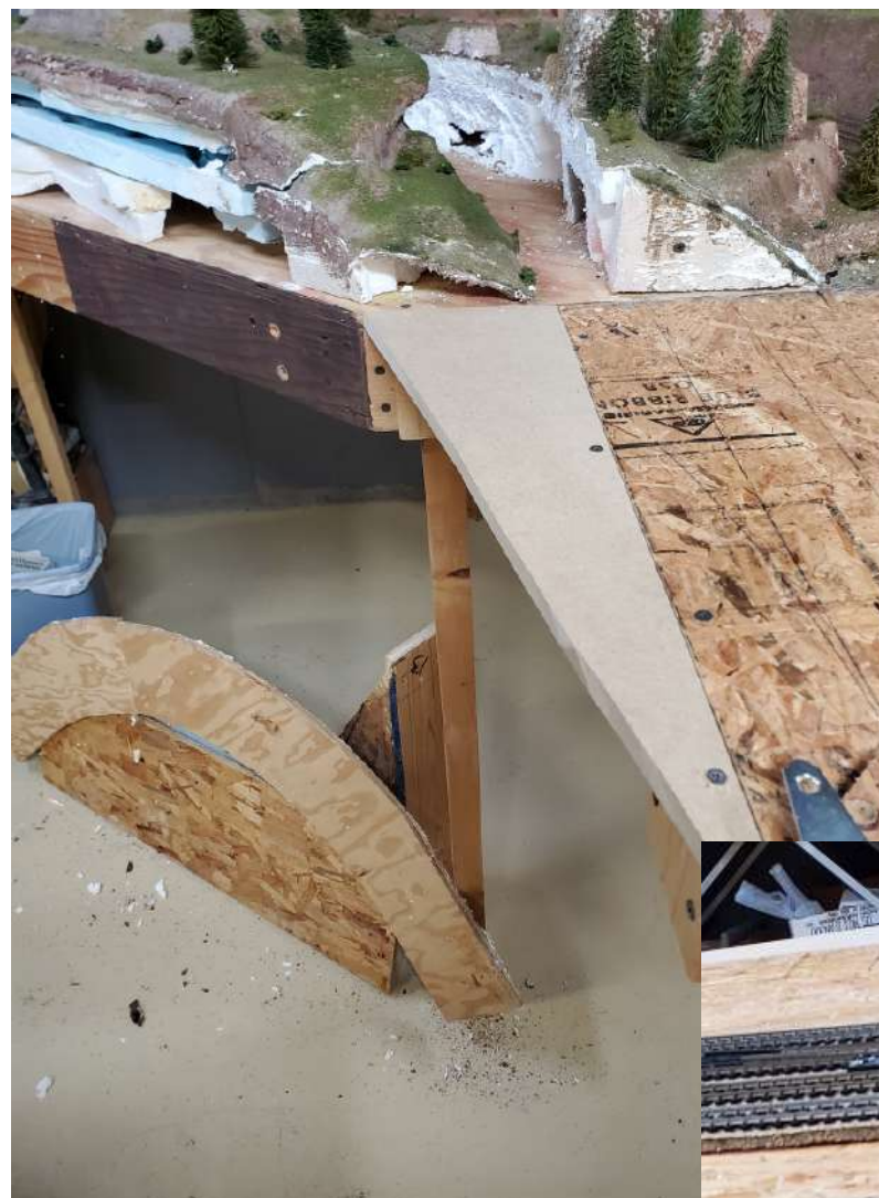
A piece of Homasote was cut to fill in the uneven edge between the hinged end and the unhinged end and to serve as a scenery base.

A draw latch on the unhinged end worked well for holding the lift-up section tight against the rest of the layout. However, it couldn't be reached once you were inside the layout. This will be moved to the top side to be accessible from both inside and outside of the layout. I will have to figure out how to hide it.