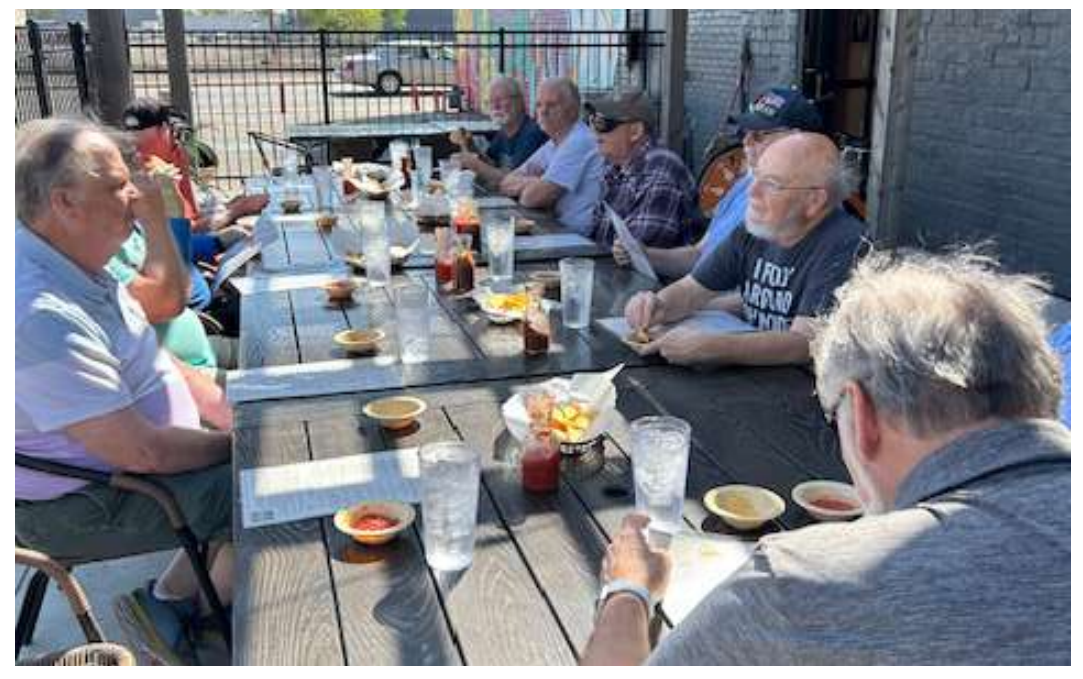
The "Third Thursday" lunch group met at Connie's Mexico Cafe in hopes of seeing a train pass by. There was a lot of fellowship and good food, but no trains.

The March and April Chisholm Trail Division meetings had last minute cancellations of the scheduled programs, so the internet provided videos for the "clinic" portion of the meetings.