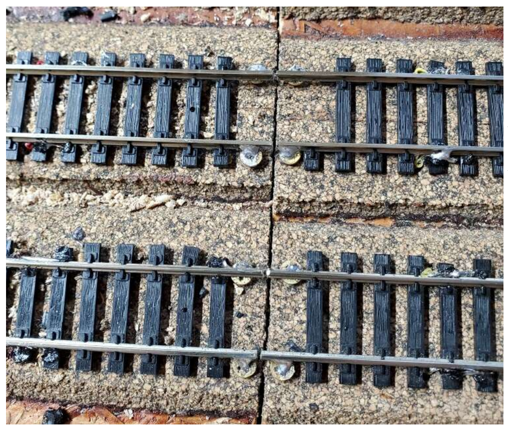
At the track joints, flathead screws were inserted to the proper depth and the rails were soldered to the screw heads. Then the rails were cut. This ensured proper alignment. Except for hooking up feeder wires, this was all that was done on the hinged end.

On the unhinged end, the same basic procedure was followed except that that short springy wires were soldered to the lift-up rails/ screws so that they rested on the screws on the fixed track next to the lift-up end. The stationary rails on the layout were gapped several feet back so that power was cut when the lift-up was raised and received power when it was down. This was to prevent trains from plunging to their death in the open space.