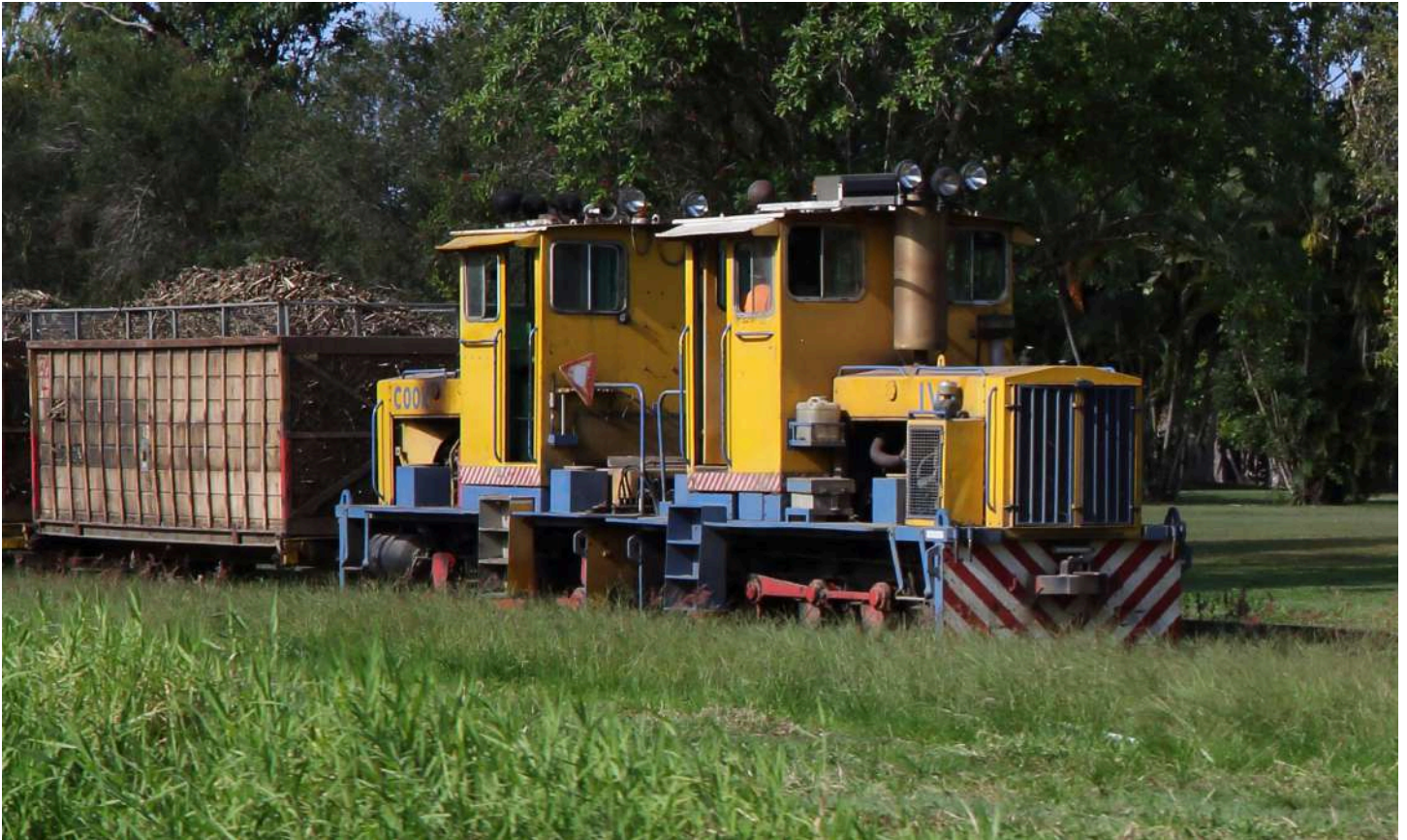
A pair of gas hydraulic locomotives pulling a string of two foot gauge sugar cane bin cars in the “Land Down Under.”

When we visited Australia in October and November of 2015, I was quite taken with the little sugar cane railroads we found in Queensland. Maybe I was already primed by a clinic about them at the National Narrow Gauge Convention, but even with that I didn't expect them to be so extensive and so easily seen.