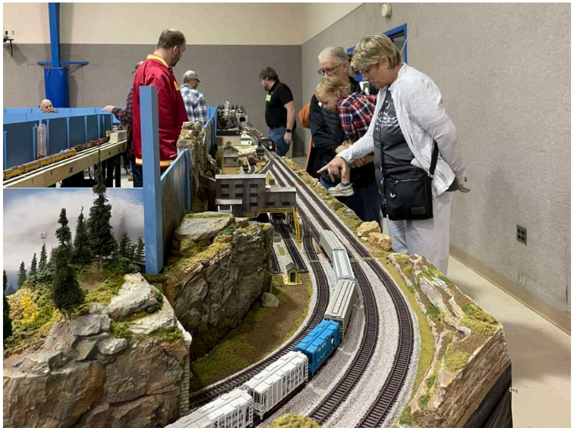
So who's having the most fun here?