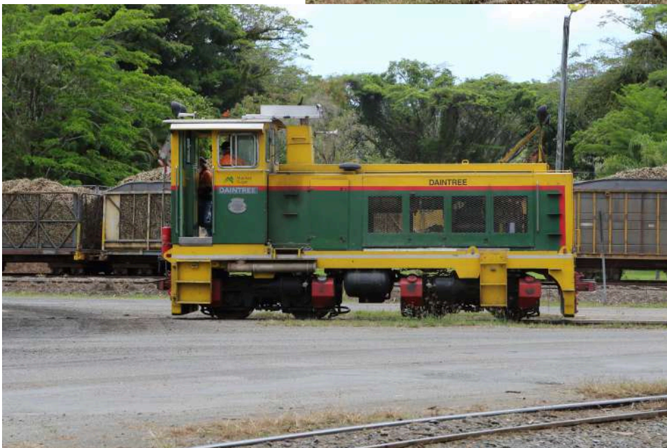
This locomotive at the mill is quite a bit bigger than the little ones I saw on the train. I am assuming that it has yard duty in the mill, but it could just as easily be a road engine. Notice different styles of bins behind the locomotive.