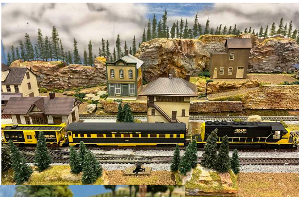
The rarely modeled K&O making the rounds on the modular layout.