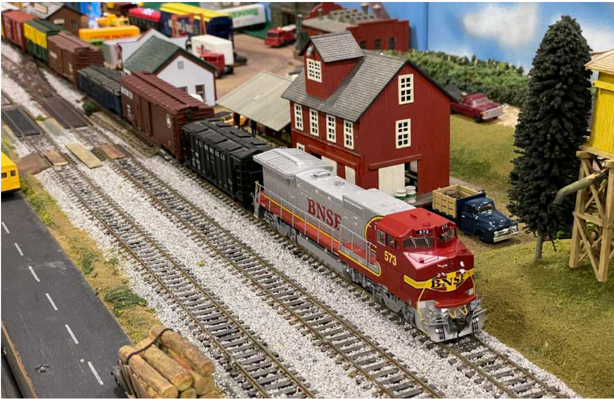
Diesels had their turn, too.