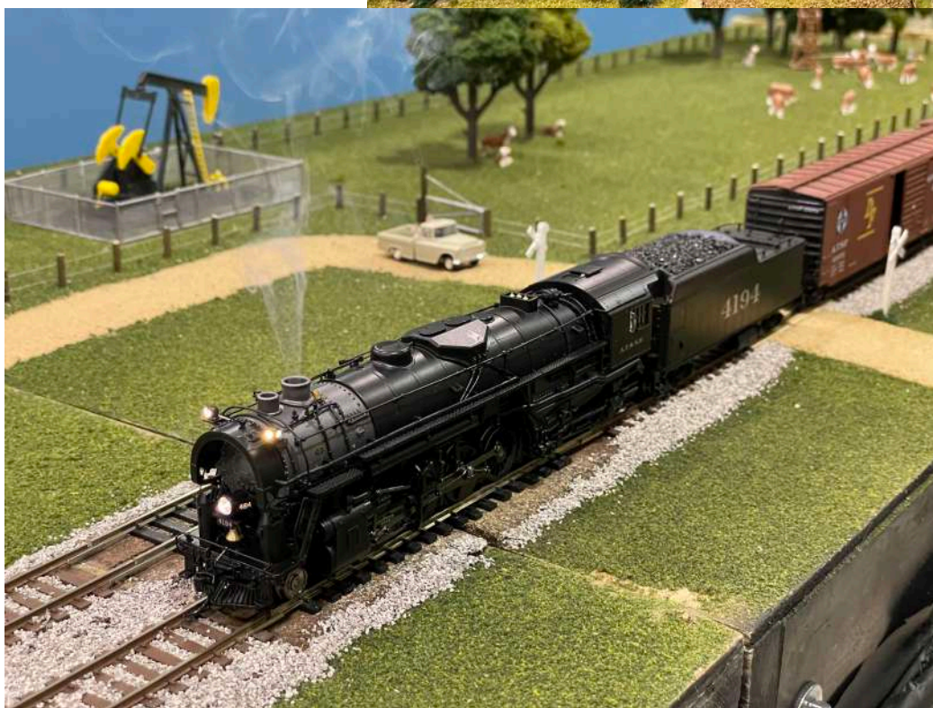
Long live steam! Dig that Coffin feed water heater in front of the smoke box.