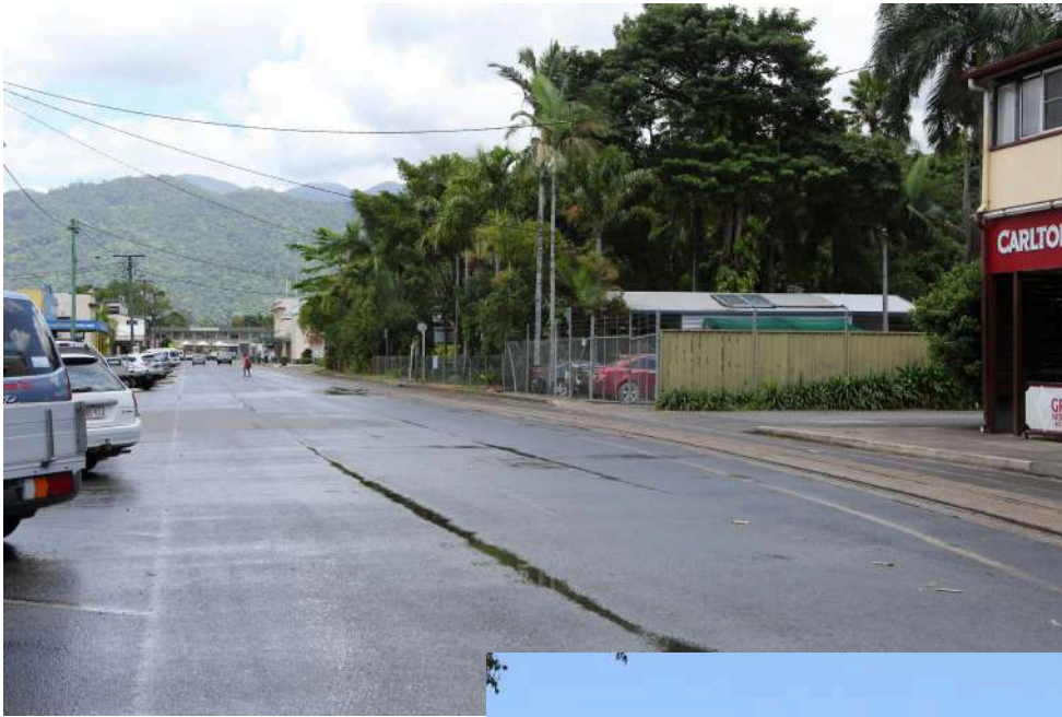
From the fields to the sugar mill often means rails through city streets. This is downtown Mossman and the mill is at the far end around the corner.