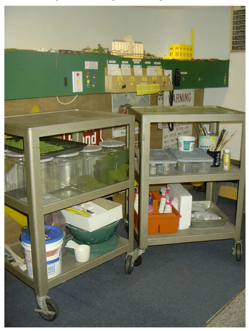
Both of my bargain carts loaded with the modeling supplies that I used.

After seeing an article in <u>N Scale Railroading Magazine</u> on how a gentleman bought some tool carts from his local hardware store to store items on. I thought wow what a great idea. Once I started looking at Home Depot, Menard's and Lowe's for these carts and seeing that they were ranging in price from $40.00 to $50.00 each, I put this idea on hold. However, when I saw these two carts for $5.00 each at Rockwell Collins Inventory Disposal Store, I thought I couldn't pass them up.