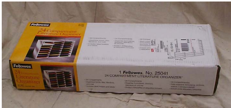
Here is the organizer as it arrived in its box.