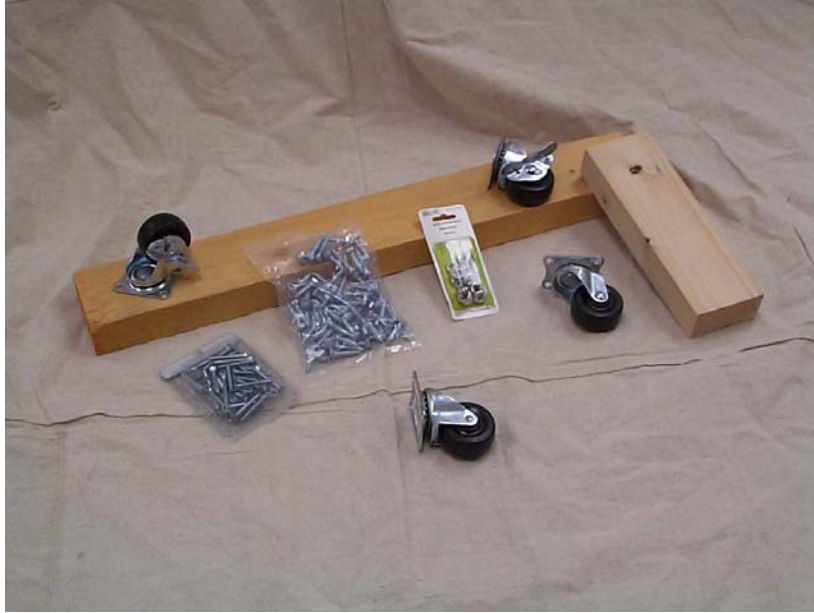
Here are the supplies needed for this project, not including the organizer.