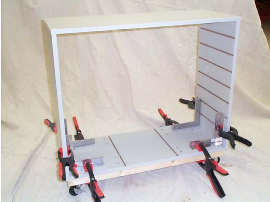
This photo shows the box of the organizer after it was glued and clamped together.