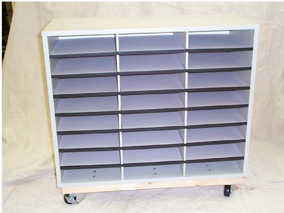
Here is the finished magazine storage unit. I found that each slot would not always hold a full 12 months of magazines.