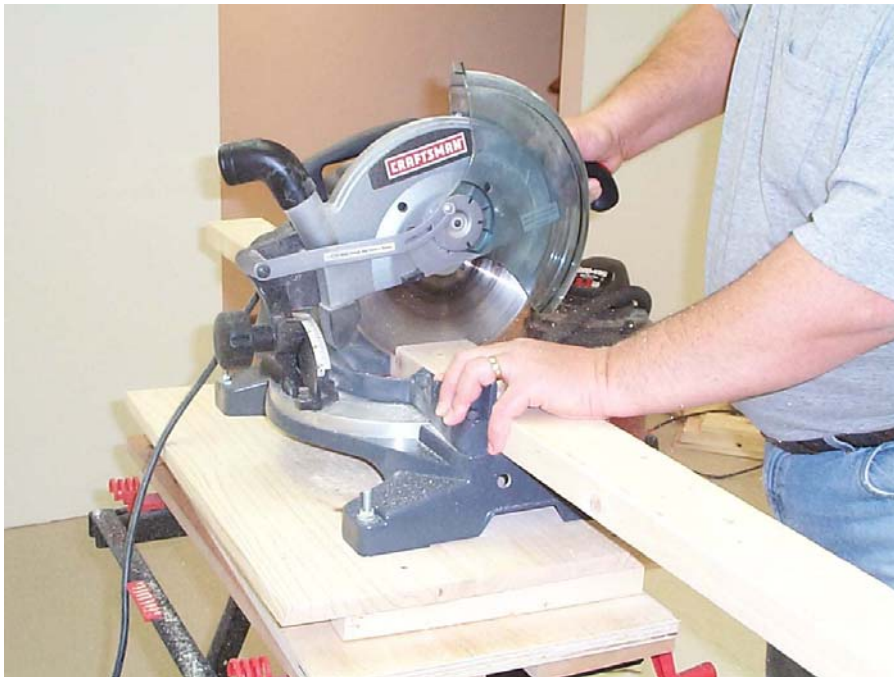
Here I am cutting 28-inch lengths of 2 x 4s that will be screwed to the bottom of the literature organizer.