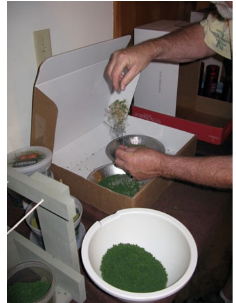
Step #2/Station #2 - Sprinkle...