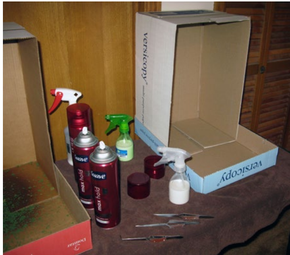
...Spray-booths with various sprays...

LOL - and a good time was had by ALL (Thanks to ALL the Hoover's)