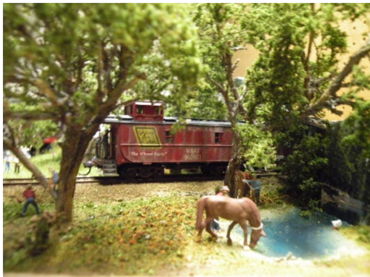
Caboose above was weathered