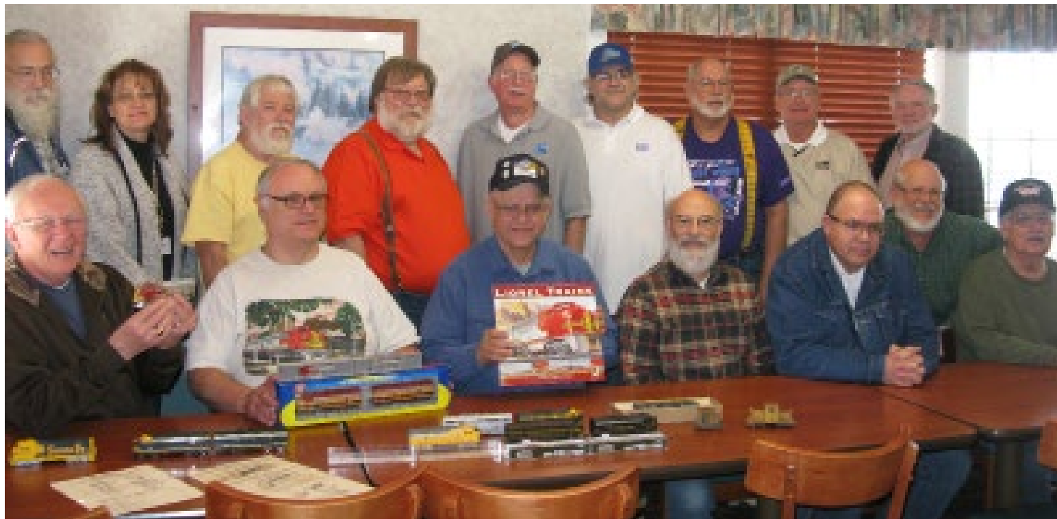
WAMRR Luncheon Meeting (April 15, 2014)