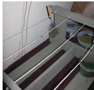
the first tree hanging to dry