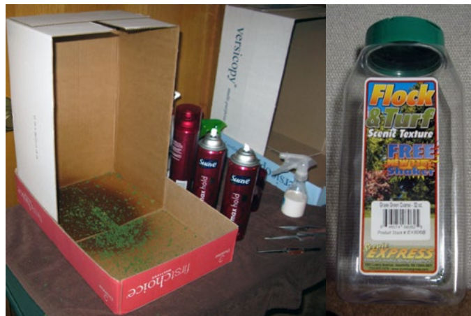
WELL-used spray booth