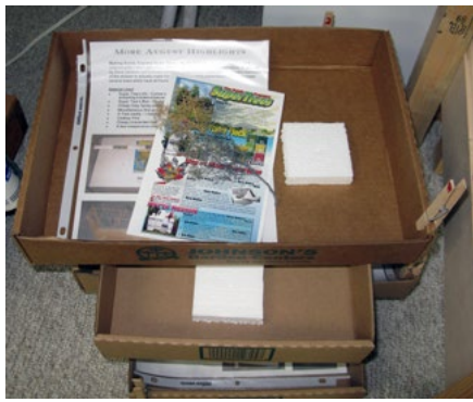
...our preAssembled kit-tray...

This Clinic was well thought-out and planned-out. We each were provided with a kit similar to the one in the photo to the left. Instructions; Information; a SuperTree™; a foam block (previously hot-glued to the tray-like box); and a numbered clothes-pin in order to keep track of our personal tree.