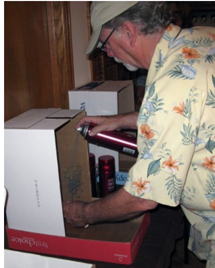
Step #1 - Spray the SuperTree™ using inexpensive (odorless) hairspray