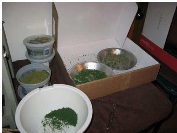
Flocking-Station with extra in readiness...