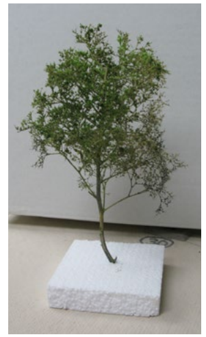
Bob's "Visual Aid"

We were encouraged to emulate nature - so keep photos close by for reference