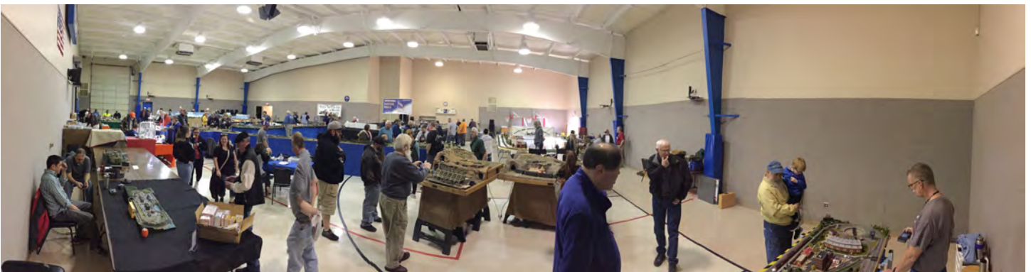
Below: A panoramic view of the layout room.