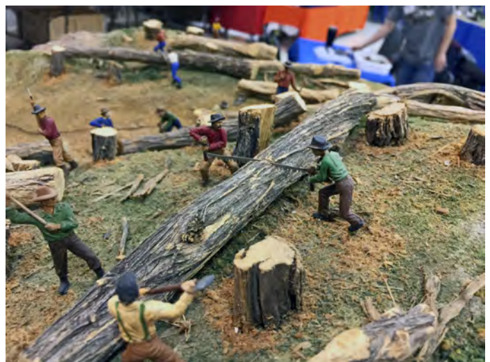
Logging detail on the On30 layout.