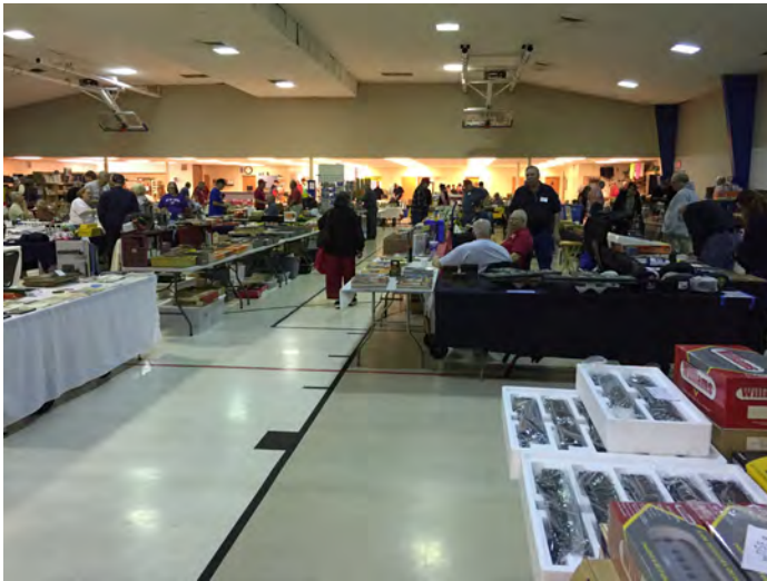
Plenty of vendors were on hand.