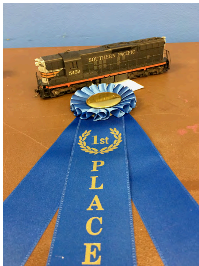
Diesel Engine – Lloyd Hurst