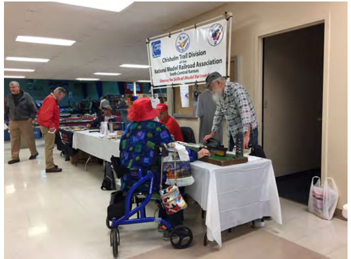
Chisholm Trail Division's NMRA booth.