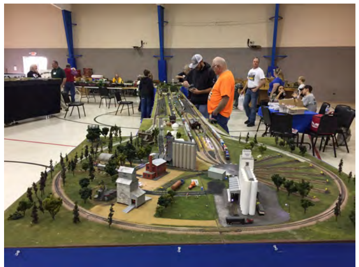
An N-scale modular layout in a "dog bone" style.