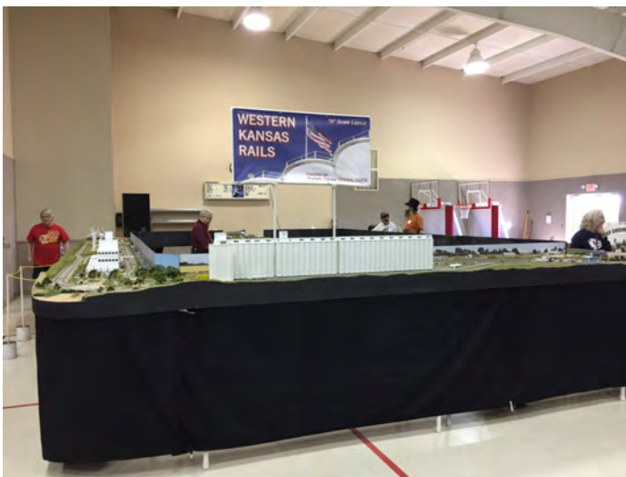
Modular N-scale layout from Western Kansas.