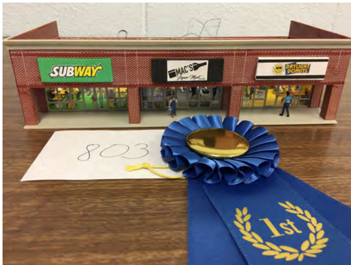
Structures – Pam MacPhail