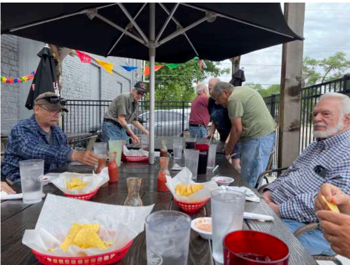
Adding another table. Though not strictly an NMRA function, nearly all attendees are Division members. We ate outdoors at Connie's Mexico Cafe and watched as quite a few trains ran by.