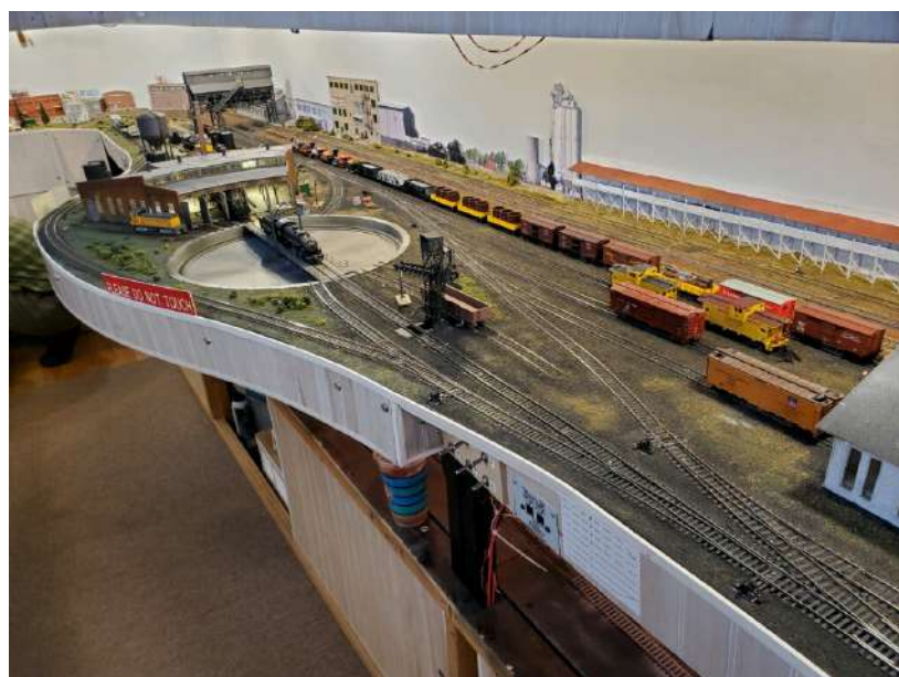
(Right) Not quite enough room for a roundhouse? Just make a bulge into the aisleway. This is the middle level of the Tri-City layout with a staging level below this