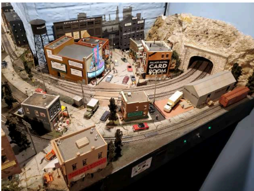
(Left) An urban scene on the D&EM. The tunnel takes the mainline into the next room.