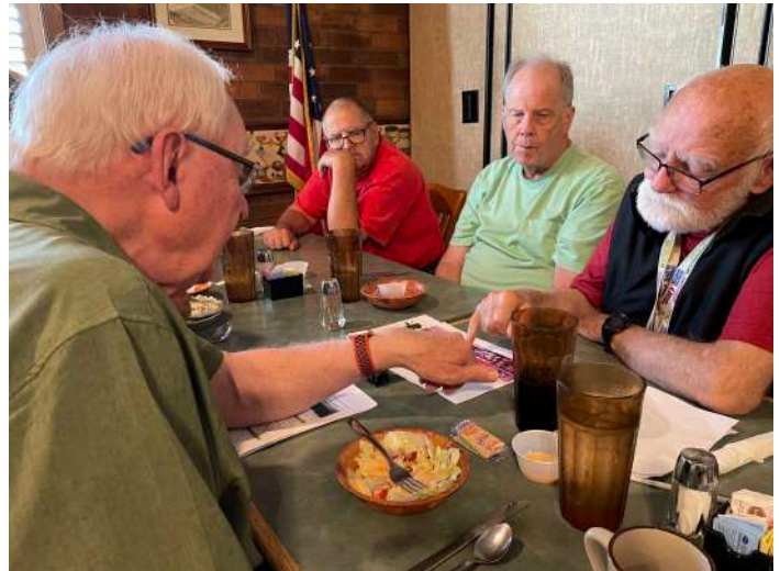
Wichita Area Model Railroaders gather at Spear's on second Thursdays of the month, which is free pie day. June's topic was the development of the road switcher during and after WWII.