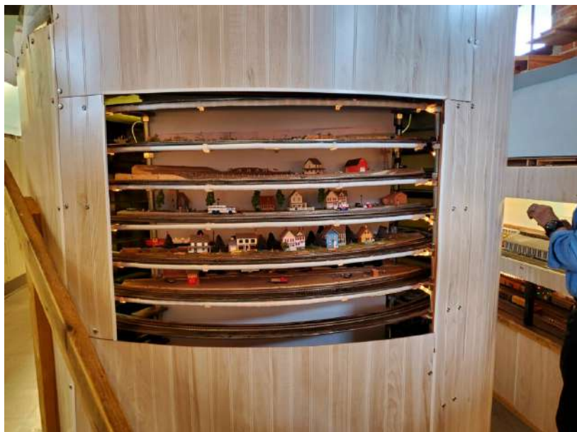
(Left) The Tri-City Model Railroad Association layout is located in the Grande Island depot. It represents two railroads, the Union Pacific, with 655' of double track mainline, and the Chicago, Burlington and Quincy, with 455' of single track mainline. This is one of four helixes that move trains between levels.