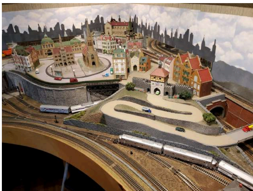
(Left) Tim Jacobi's TD&J railroad is built in the loft of an old carriage house. Although most of it is as American as apple pie, there is one German city named "Jakoburgh." The layout is 15'x25' with 300' of mainline.