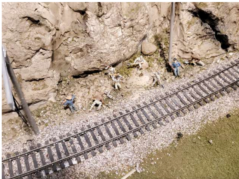
(Right) A chain gang is doing a little work in this scene from the D&EM.