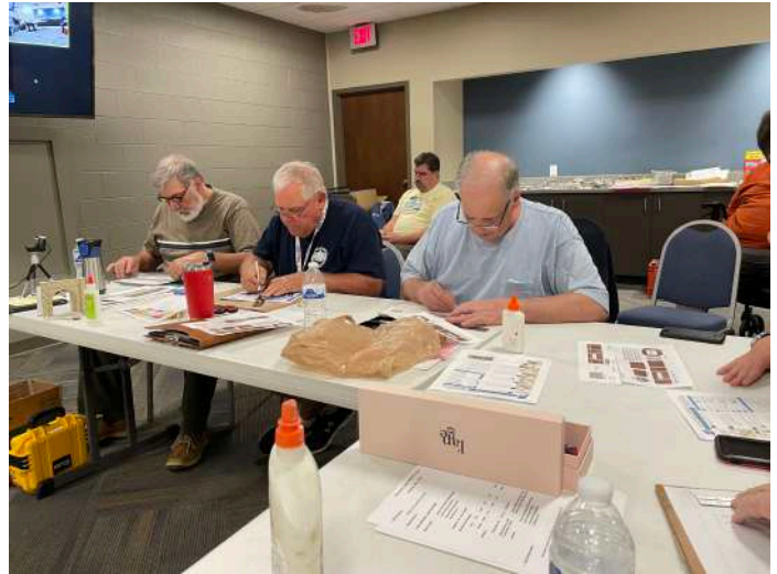
This is a model railroader's version of cutting up. There were several models to choose from, so there was something for almost everyone.