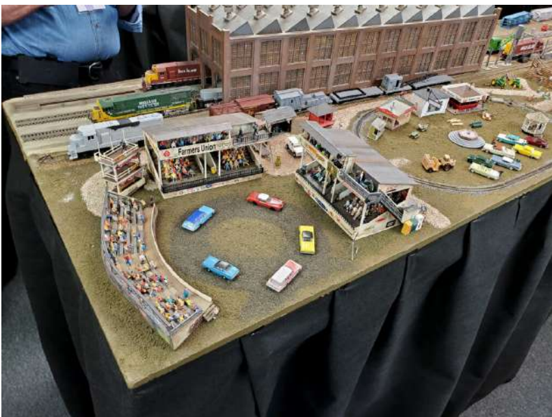
(Left) The fans are in their seats as the demolition derby is about to start and next to the stadium a train ride (Z gauge on an HO scale layout) is giving young and old alike rides around the grounds.