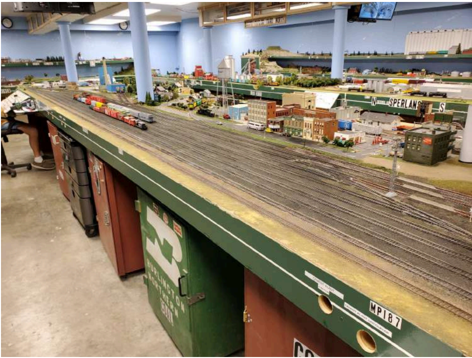
(Left) Rick Sickler's CB&Q Raccoon River Division is enormous by home railroad standards. Filling a 27'x45' room with 840' of single track mainline on three levels, the lowest being two storage/staging yards. The picture shows one of two classification yards