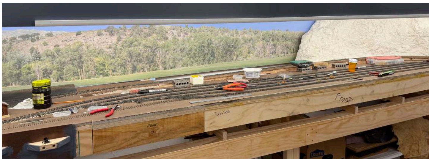
Blakely Yard as it stands today. Sure is cramped hand laying track on that lower level!