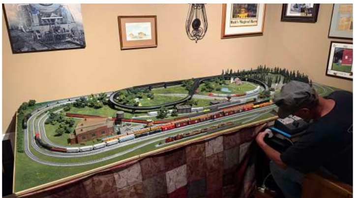
Not only were we treated to a fantastic outdoor railroad, but inside were a three-rail O-gauge layout designed to amuse the grandkids and an N-scale layout.