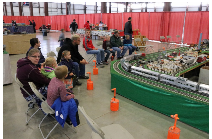
(Above) One of the more popular layouts is the large, G-scale, traveling layout and you can see it here:

https://www.youtube.com/watch?v=0zxe0A5AEzE