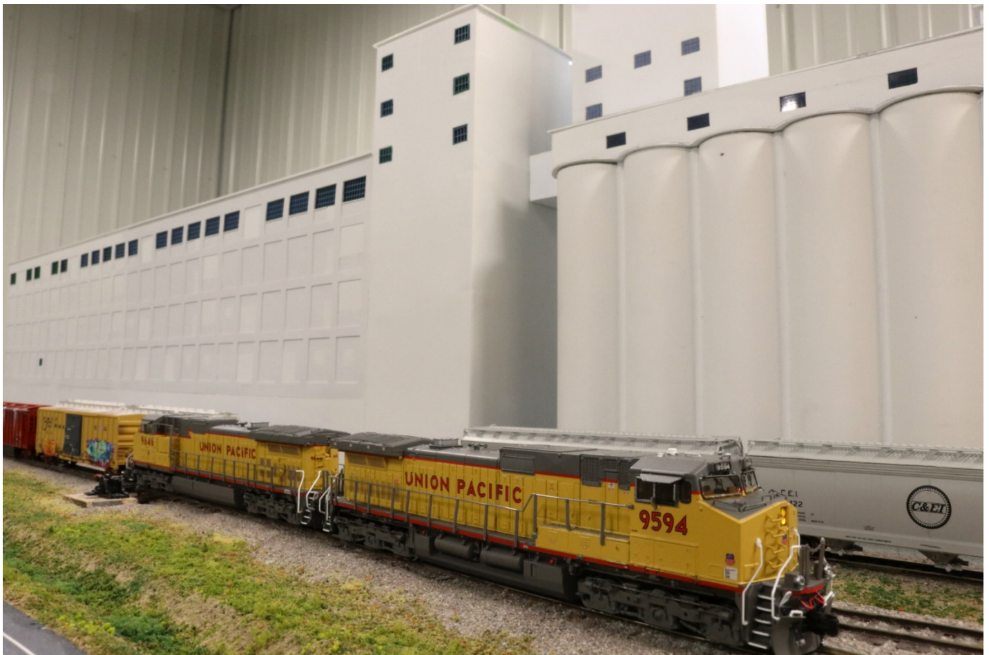
(Above) A pair of the new Scale Trains N-scale Dash 9's at work on the WKR...

After the last train show in the spring, the decision was made to switch to radio throttles with the plug-in stations as a back-up. Back in May, an order was placed for the equipment, just before the Digitrax factory was struck by a tornado, so the parts came in as they became available during the Summer and we have everything necessary to go wireless.