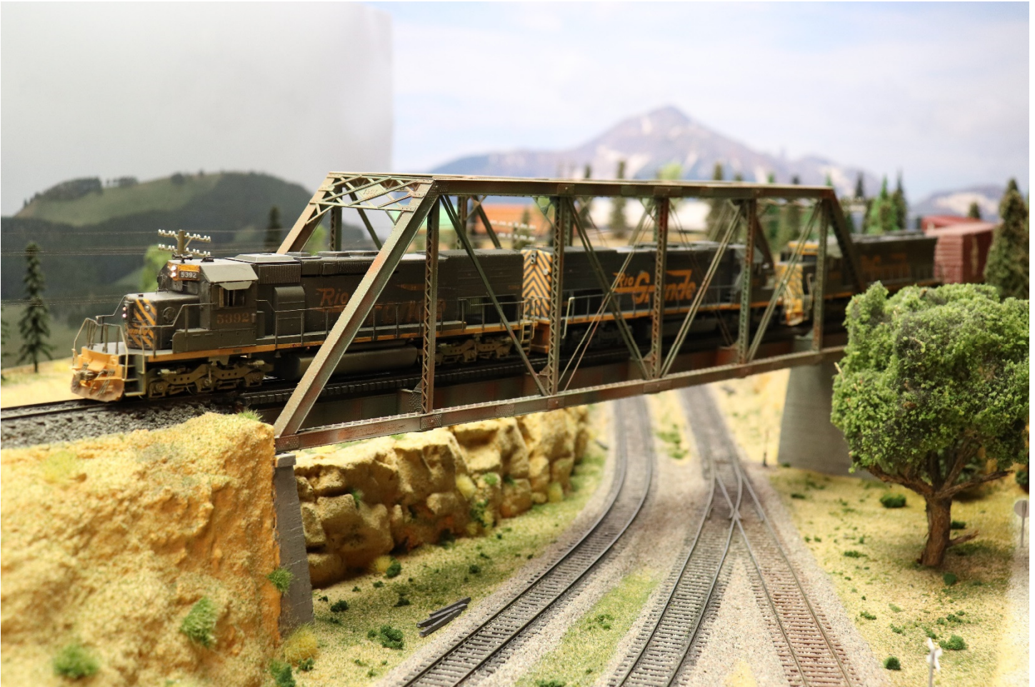
Todd Skaggs Photo