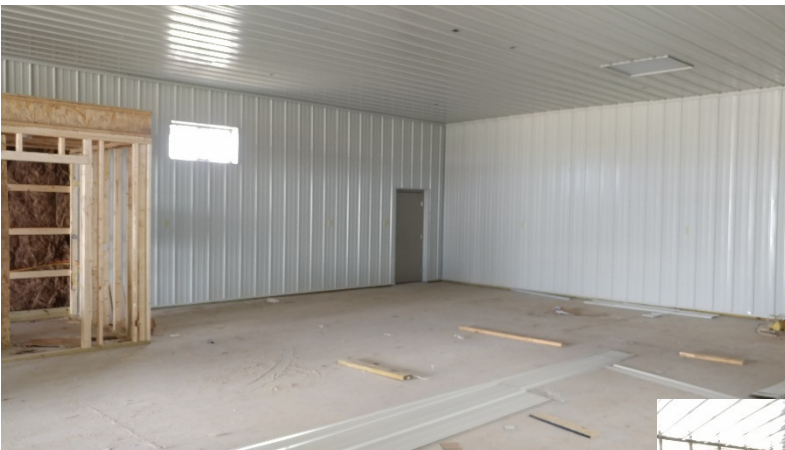
(Left) From the far right side looking towards the rear passage door.