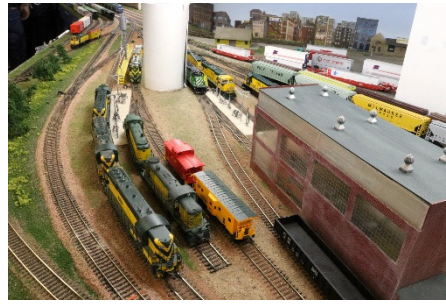
(Top Center) Grain elevator area on the lower level (West Chicago)