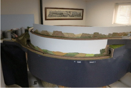
(Top Left) the "Wedding Cake helix"