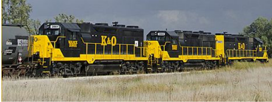
A lash-up of K&O Diesels, West of Wichita