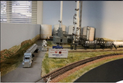
(Insert) Exiting the helix on the upper level