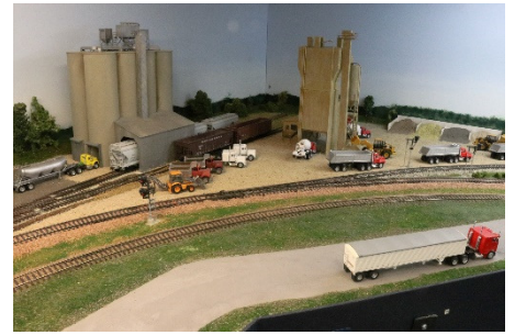
(Top Right) Also on the lower level

Layout Video 2: https://www.youtube.com/watch?v=CjuE8fo4d54