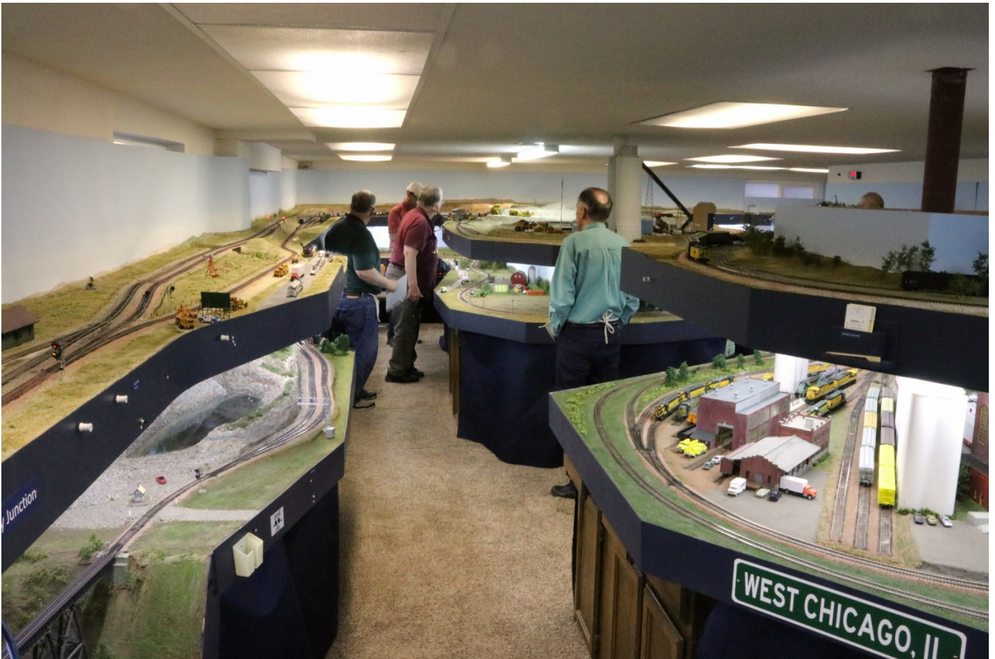
(Below) A long view of the layout room standing in front of the helix

Layout Video 2: https://www.youtube.com/watch?v=CjuE8fo4d54