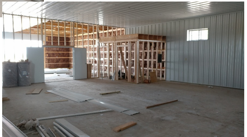
(Right) From the back corner looking out towards the front showing the dividing wall and the bathroom and utility room.