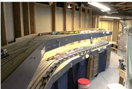
(Left) The hidden staging and Dispatcher's office