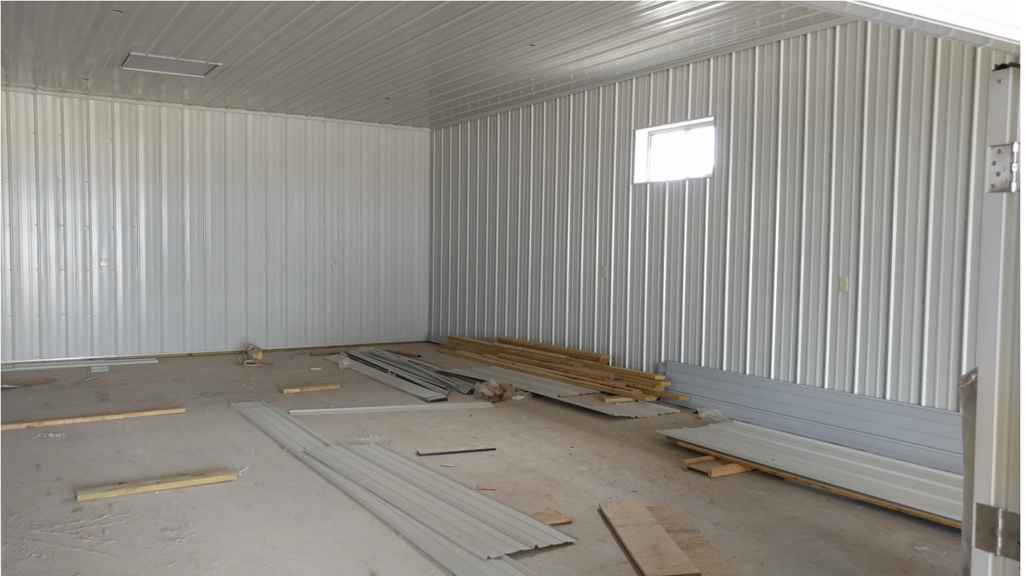
(Top) Standing at the double doors and looking in to the new home of the WKR traveling layout...